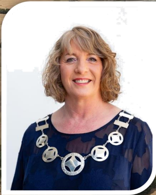
MAYOR TRACEY COLLIS