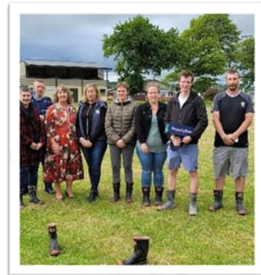
Some of the celebrities who competed.