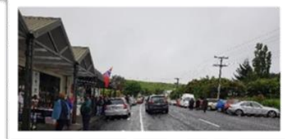
Page | 7