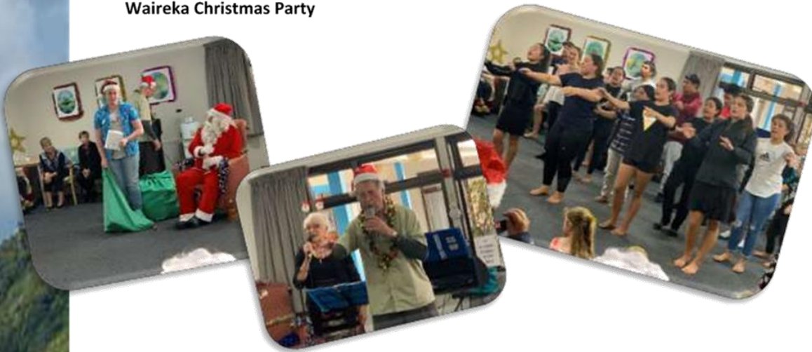
Waireka Christmas Party