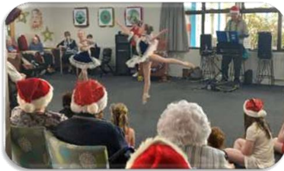
Elske Centre Christmas Party