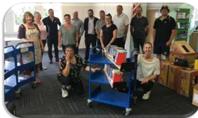
Pahiatua Library books on the move for Painting

2020 will be remembered for more than just Covid 19!